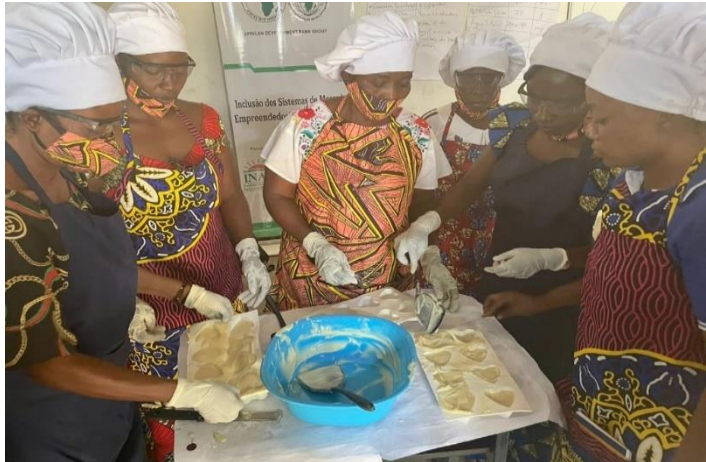
Training on producing artisanal soap in Maratane refugee settlement / 2023 ©UNHCR Mozambique.