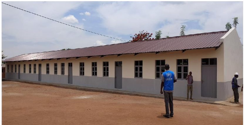
Completion of the construction of five classrooms in Maratane Refugee settlement / ©UNHCR Mozambique.