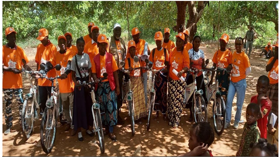
Launch of 16-Days of Activism against Gender-Based Violence in November 2023 ©UNHCR Mozambique.

campaign was to create awareness, challenge harmful norms, foster support for survivors and break the cycle of violence. Government and partners from various sectors, including protection, health, and livelihood, actively participated in diverse activities, demonstrating commitment to ending violence and empowering women and girls. In Pemba, UNHCR and partners also organised a workshop on the Protection from Sexual Exploitation and Abuse (PSEA). More than 130 people from several institutions participated in the workshop. Alongside partners, UNHCR also conducted a GBV case management training for 35 public servants.