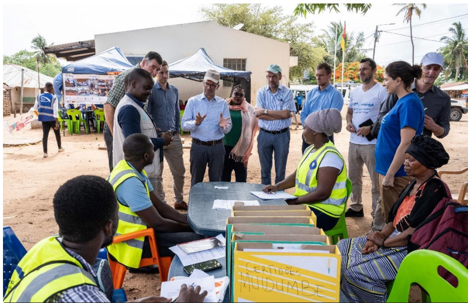
German Delegation visiting civil documentation clinic in Cabo Delgado / 2023 ©UNHCR Mozambique.