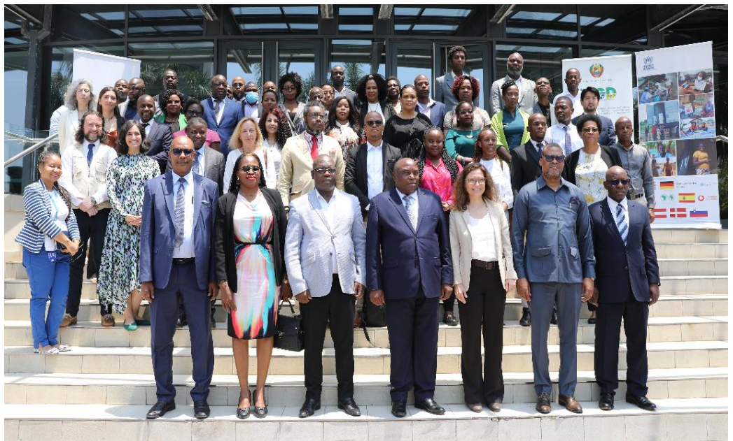
UNHCR workshop on the domestication of the Kampala convention

Convention's provisions into the national legal and policy framework on internal displacement in Mozambique. The workshop was attended by government dignitaries, donors, NGOs, UN-agencies, and the UN Resident Coordinator.