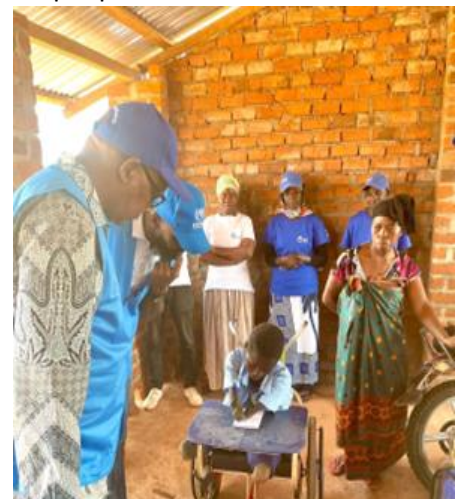
UNHCR Representative, engaging with People with Disabilities (PWD) in Corrane IDP site, Nampula.