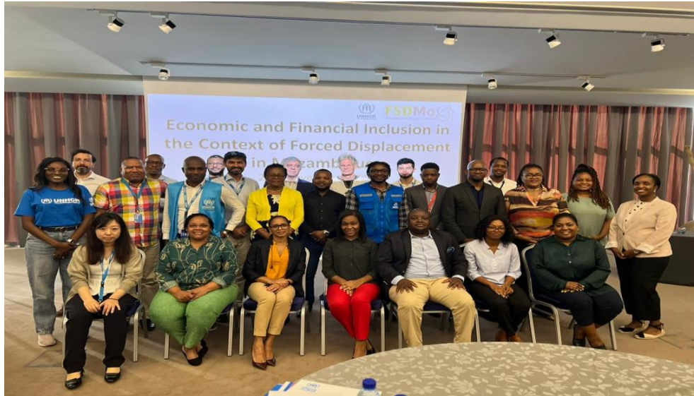
The Economic and Financial Inclusion Workshop in the Context of Forced Displacement

linkages, enhancing livelihood opportunities, and build better resilience for vulnerable populations. It was also an opportunity to collectively identify partnerships essential for the realization of the desired strategic outcomes aimed at sustainable inclusion in national and provincial financial inclusion planning.