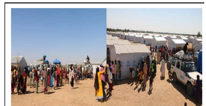
Relocation to Dougui