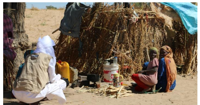
A CNARR social worker interviewing a new Sudanese household arrived in mid-January, settled at the Koroba site in Wadi-Fira