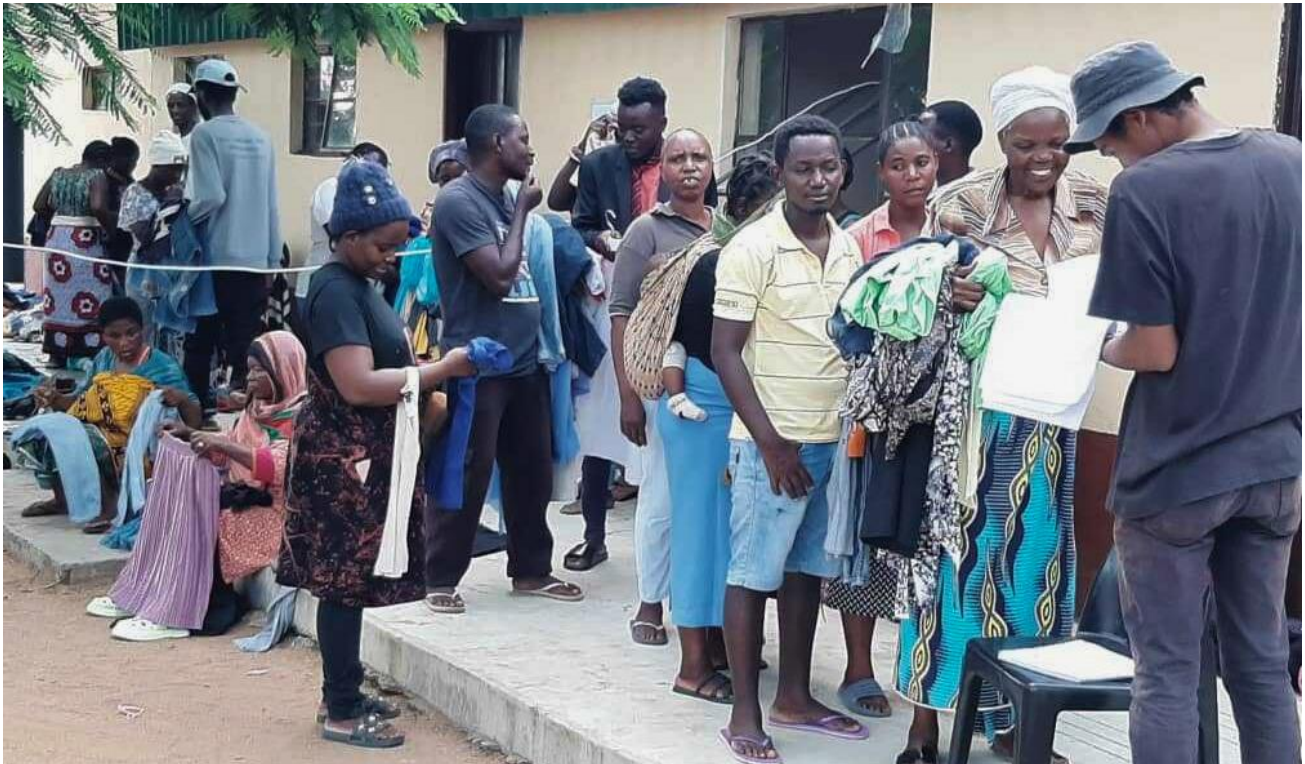
Distribution of clothing to asylum seekers at the Malindza Refugee Reception Centre in Eswatini by World Vision, the National Disaster Management Agency, and the Ministry of Home Affairs.