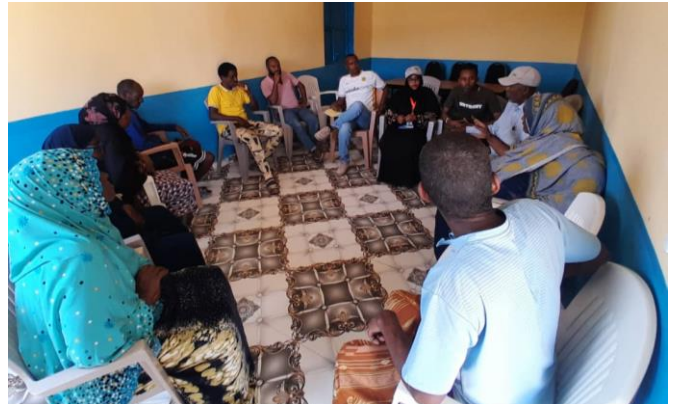
UNHCR and its partners raise awareness among refugees and asylum seekers following the Djibouti Interior Minister's declaration of the new political strategy

UNHCR raises awareness among refugees and asylum seekers following the declaration by Djibouti's Minister of the Interior of the new political strategy to combat illegal migrants. On April 10, UNHCR, in collaboration with ONARS and CIAUD, launched a series of awareness-raising sessions aimed at informing and sensitizing people under its mandate about the new policy strategy to combat illegal migrants, calling on all foreign nationals residing illegally in Djibouti to leave the country voluntarily and peacefully within a month. The aim of these awareness-raising campaigns is to limit the potential risk of deportation when controls begin, and to encourage them to carry their identity documents with them at all times. Refugees and asylum seekers needing to renew their documents are encouraged to do so for any expired or soon-to-expire documents.