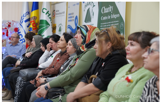
Refugee women from diverse countries came together at the Charity Centre for Refugees, UNHCR's partner, on International Women's Day. While such gatherings offer a valuable space for mutual support and expression, they also highlight the broader need for community-driven initiatives that empower women and support their integration. Women and children, who make up the majority of refugees in Moldova, often face heightened protection risks, economic insecurity, and barriers to accessing the labour market—making inclusive, community-driven support and opportunities for empowerment all the more vital.

UNHCR, in collaboration with Casa Marioarei, organised a five-day training for 12 mentors to implement the International Rescue Committee's (IRC) Girl Shine curriculum. The programme, tailored for adolescent refugee and Moldovan girls and their caregivers, aims to strengthen life skills, self-esteem, and support the development of healthier, violence-free relationships. In parallel, and in coordination with UNICEF and with support from People in Need, UNHCR trained 115 EduTech Labs staff to recognise gender-based violence (GBV) risks within educational settings and safely refer survivors to appropriate services. These combined efforts strengthen GBV prevention and response across both community and learning environments.