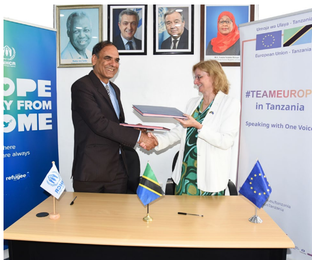
EU Ambassador to Tanzania and UNHCR Representative a.i in Tanzania sign an agreement to strengthen protection and assistance to Congolese refugees and asylum seekers in Tanzania.

*Figure may be adjusted subject to reconciliation.