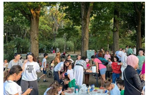
On 30 August, UNHCR together with NGO Green Revolution (Roaba de Cultură) held the third edition of “Together in the Park”.

On 30 August, UNHCR in collaboration with the NGO Green Revolution (Roaba de Cultură) and 8 partners of the Refugee Response Plan (RRP), held the third edition of “Together in the Park” in Herăstrău Park celebrating social cohesion, multiculturalism, and the power of community. The open-air event on the theme “Art without Borders – bringing communities together through arts and culture”, featured cultural and arts workshops for children and youth and photo exhibitions. The event successfully brought refugees, migrants, and the host community together in a playful manner forging bridges between the communities in Bucharest.