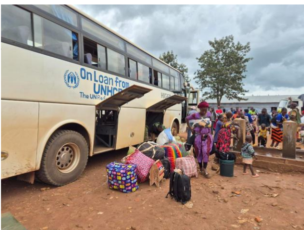
Burundian refugees prepare to board buses for repatriation at the departure centre in Nduta Camp.

* Figure may be adjusted subject to reconciliation.