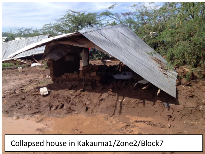
Collapsed house in Kakauma1/Zone2/Block7