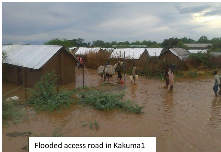
Flooded access road in Kakuma1