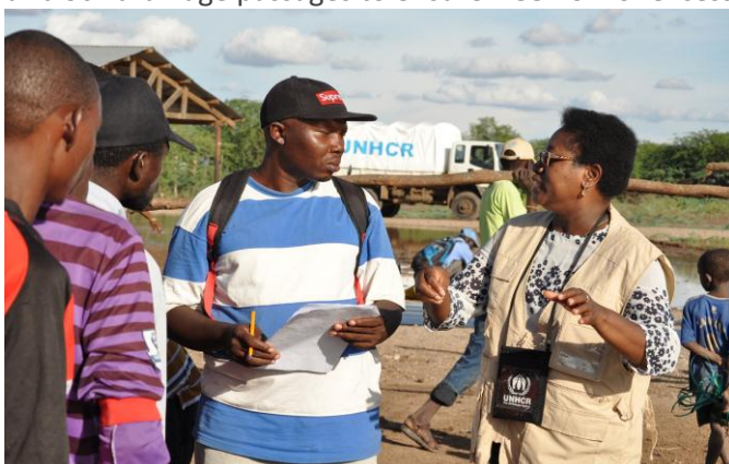
The Head of sub-Office speaks to some families in the camp as they wait to receive NFIs and building materials to reinforce their houses.