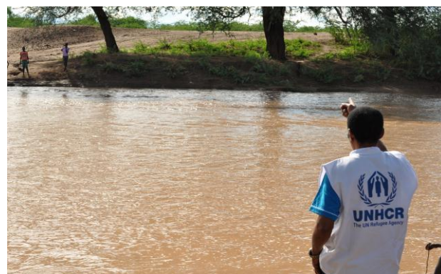
Right: Parts of the camp were inaccessible for hours due to flooded rivers.