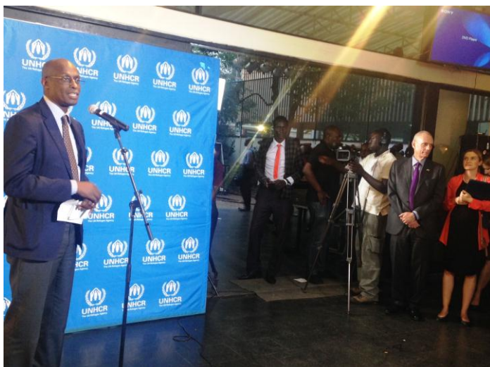
Left: UNHCR Country Representative launches the Project at the Alliance Française in Nairobi. Ambassadors and representatives from the donor community were in attendance including members of the public.