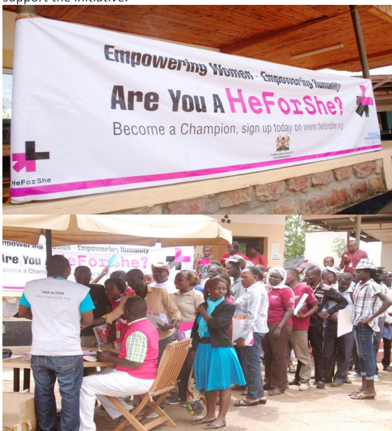
The HeForShe banner was displayed at the UNHCR compound where the campaign was launched. Staff (especially male) from various agencies came out in large numbers to support the initiative.