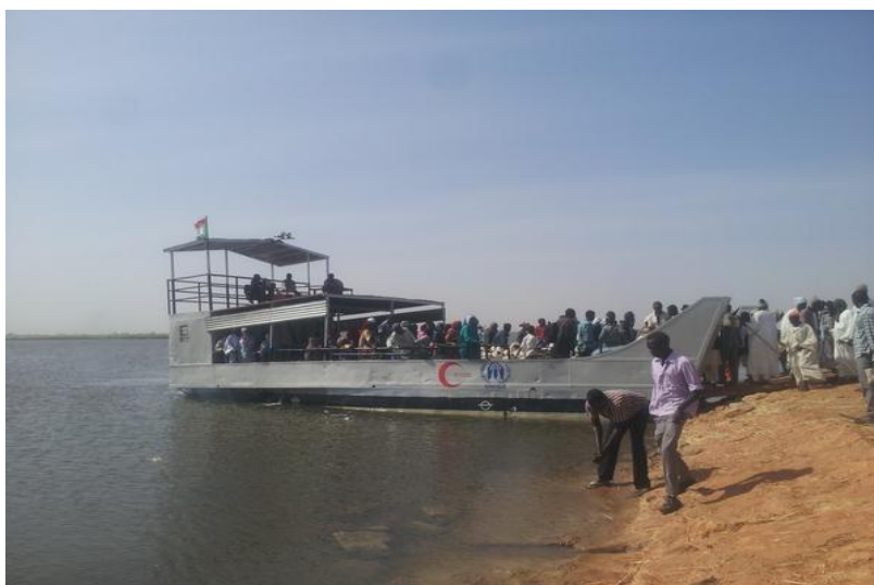
A rehabilitated ferry on the White Nile River supported through an initiative of the UN High Commissioner for Refugees in support of the host community in White Nile State.