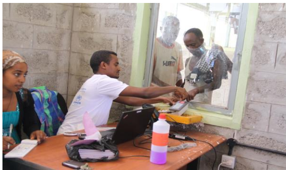
Biometrics goes live in Shimelba camp to improve food collection procedures