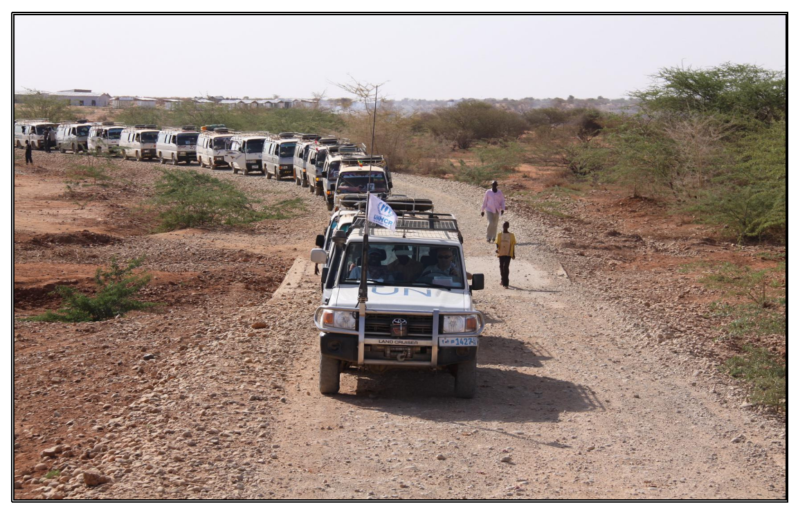
A relocation convoy from an earlier movement of refugees from the Transit Centre to Melkadida. A similar relocation of refugees from the Transit Centre to the newly opened Hilaweyn camp was launched this morning.