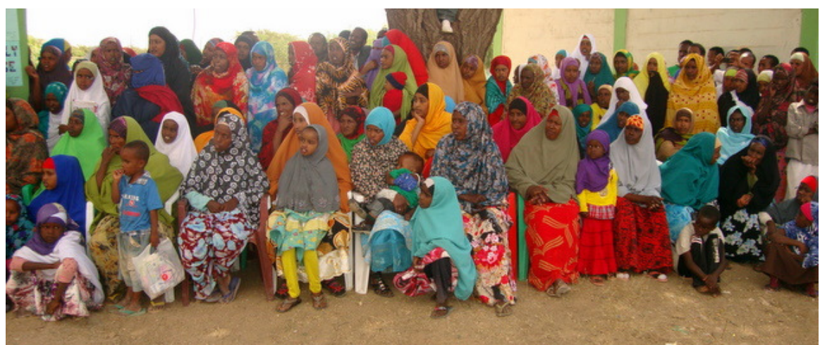
Celebrations in Aw'bare Refugee Camp