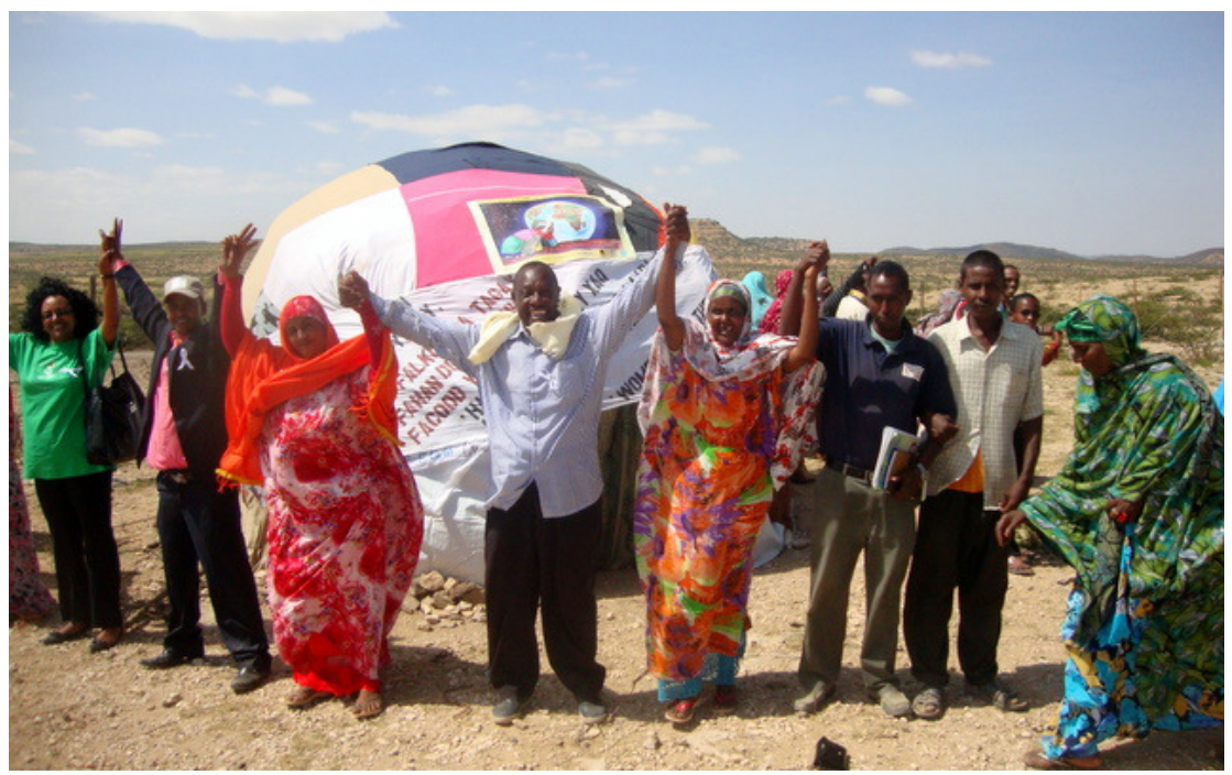
Men and Women at the Peace Tukel in Shedder Refugee Camp uniting to end violence against women.

In deference to the 2011 theme of 'Peace in the Home to Peace in the World', UNHCR with IRC and the refugee community constructed Peace Tukels in each of the camps. The Peace Tukels , as with the traditional Somali pastoralist habitats found in the camps, are covered with a patchwork cloth. Messages from the community promoting positive change and ending violence against women were collected and adorned the patchwork coverings.