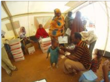
Photo: Mass polio vaccination and nutrition screening in Bokolmany camp

U5: Under 5 WCBA: Women of child-bearing age