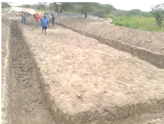
A drift under construction on the road between Hagadera and Kambioos