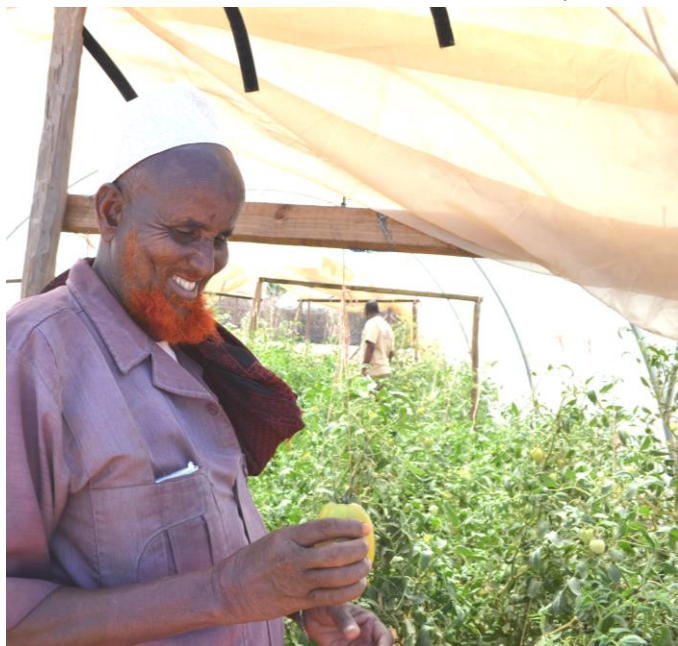
One of the tomato growers in Kambioos camp (LWF greenhouse)

vulnerability aspects as well as environmental protection. FAiDA has therefore embarked on including former charcoal burners into the projects in order to give them a new and environmentally friendly source of livelihood. All three agencies provide training to the beneficiaries in agricultural methods. The refugee teams working in the greenhouses consume some of their produce and sell the rest. This enables them to live healthier and to generate some income.