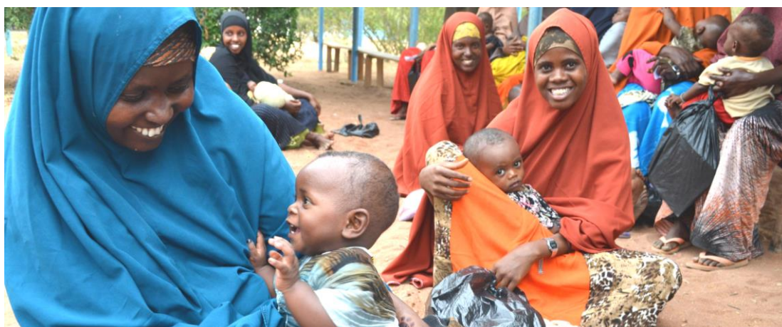
Mothers and children awaiting registration in UNHCR's field office in Hagadera Camp

Having their children registered with UNHCR means that families receive food and other assistance for one more person.