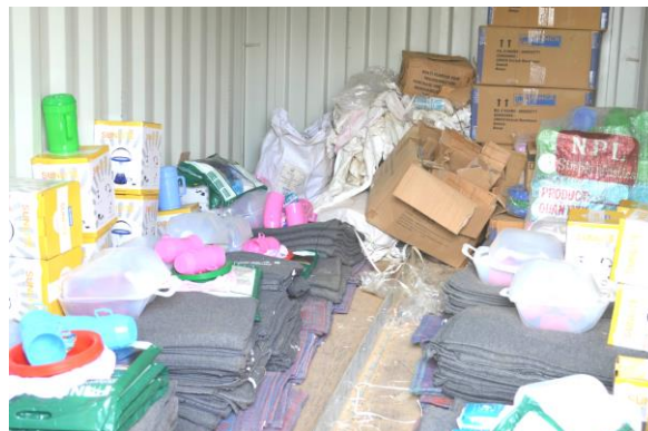
Non Food Items for distribution to returnees

A total of 341 individuals returned to Somalia on 6 th , 10 th and 15 th January. Before departure, they underwent counselling by UNHCR and partners on conditions in Somalia, especially with regard to security. They also received a return support package comprising of an unconditional cash grant, essential travel and hygiene kits for use during the journey home, tools, food and other basic needs assistance to support the sustainability of return and reintegration in Somalia.