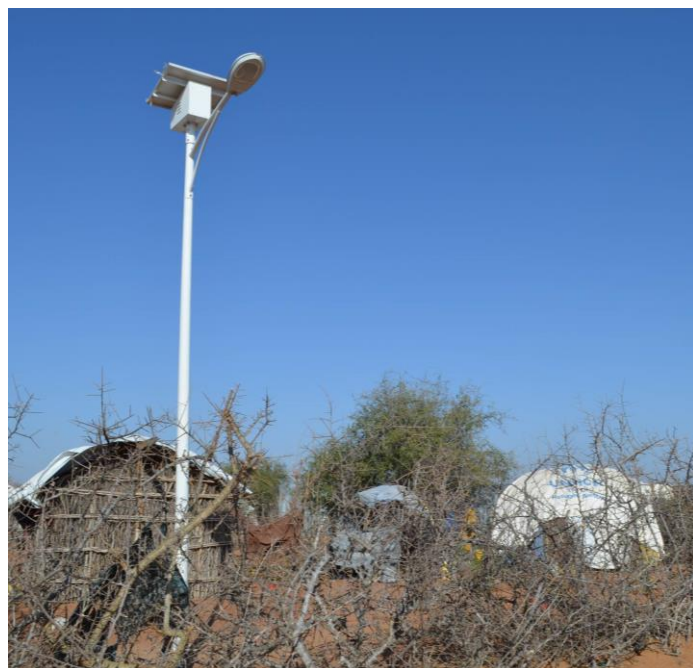
Newly installed Solar Street light in Kambioos