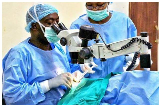
Doctors performing eye surgery at the IRC hospital in Hagadera refugee camp.