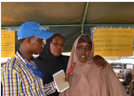
A woman living with disability, passing her message on radio during the International Women's Day 2015 celebrations at Ifo camp.

A task force comprising of UNHCR, RCK, DRA, IRC, DRC, Heshima Kenya, Kituo cha Sheria and HIAS Kenya also visited Dadaab simultaneously with the MPs. They too met with refugees, host community members and other stakeholders to collect inputs that will help in drafting the national asylum policy on refugee management in Kenya.