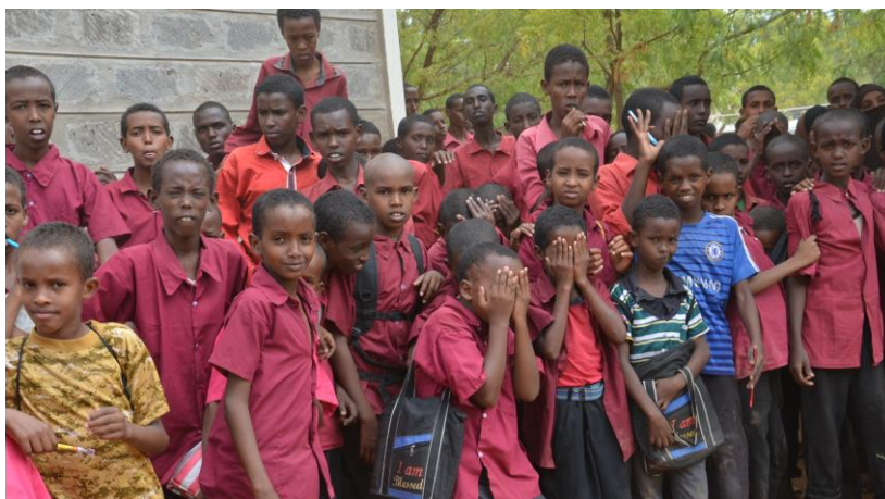
Primary school children at Unity primary school in Dagahaley camp.