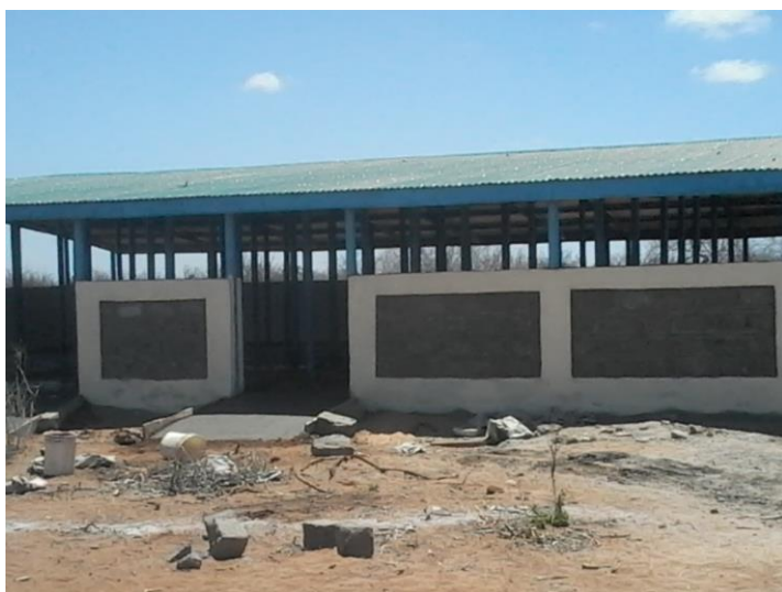
New market stalls in Kambioos camp.