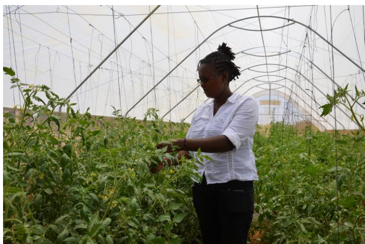
One of the greenhouse projects established in Ifo 2 camp by KRCS.