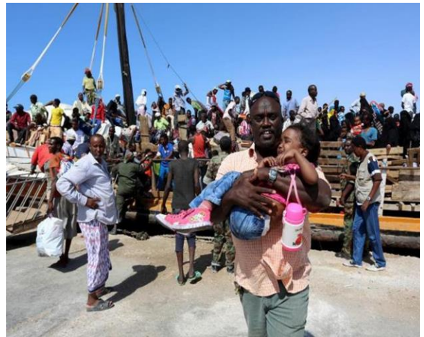
New arrivals from Yemen at the Berbera Port in Somaliland are received by UNHCR and partners and provided with emergency health care and other requirements. May 2015.