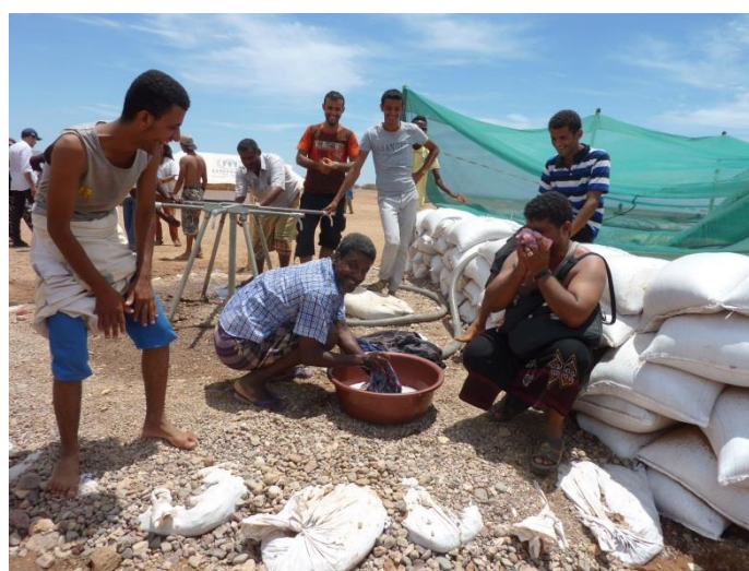
Yemeni refugees at the water point in Markazi camp, Djibouti. Two water bladders are now in place with a capacity of 15,000 litres each. May 2015.