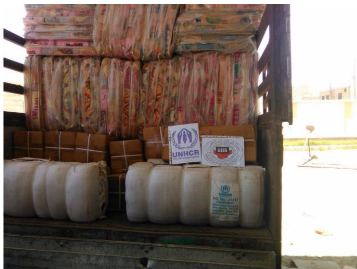
Newly displaced persons in Al-Bureiqa received these essential items, including mattresses, cookware, and buckets from UNHCR's partner, Society for Humanitarian Solidarity (SHS).

Somalia: As of 8 May, there are now 4,798 arrivals since the beginning of the conflict of which 327 are Yemeni nationals and 4,426 are Somalian.