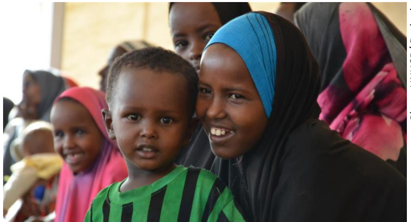
Children before boarding the bus to Somalia

Since the announcement of newly added return areas, increased trends of refugees visiting the return help desk and declaring their intention to return have been observed.