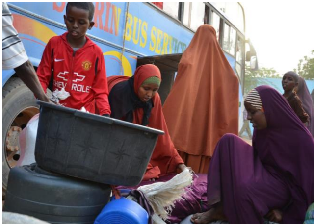
Returnees packing belongings for their trip to Somalia

Voluntary return movements resumed on 9 th June, following a temporary suspension of return convoys due to rains that made roads impassable in Somalia. During the first half of June, three convoys with a total of 265 returnees departed Dadaab and arrived safely in Somalia. The total number of returnees provided with return support packages since December 2014 stands at 2,313 individuals. The voluntarily return process is being strengthened and new returns areas were announced on 4 th June to allow more refugees who have expressed their desire to return to do so. This includes Mogadishu, Jowhar, Afgoye, Baledweyne, Wanlaweyn, and Balcad districts in Somalia. This is in addition to the existing areas of return Kismayo, Baidoa and Luuq. While reintegration assistance will only be available in the nine indicated areas thus far, the return package will be given to all refugees seeking assistance to voluntarily return to any area of Somalia.