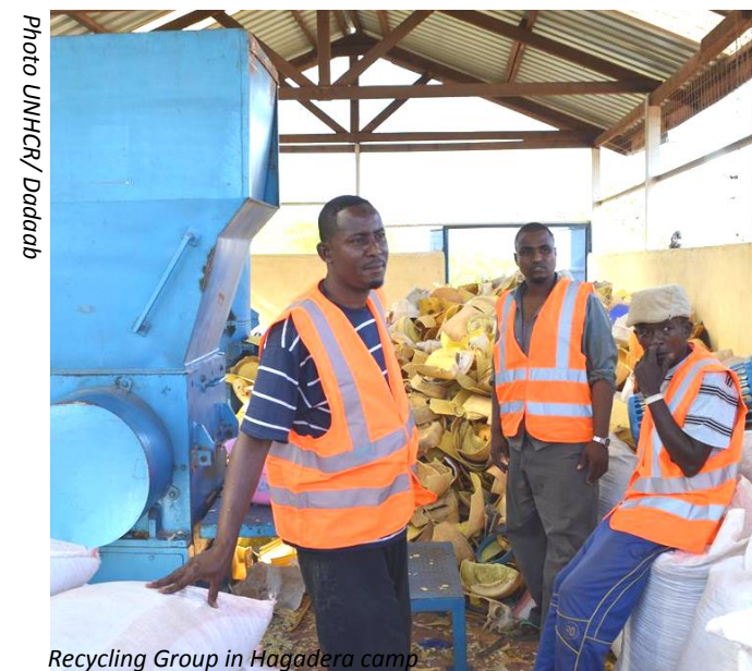
Recycling Group in Hagadera camp