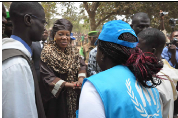
New president greets UNHCR Staff in Boy Rabe Monastery.

On 1 February 2014, the newly elected President of the Transition, Ms. Catherine Samba-Panza visited three IDP sites together with the humanitarian community (IOM, OCHA, UNFPA, UNICEF, UNHCR, and WFP). The sites visited included the Boy Rabe Monastery in the 4th arrondissement of Bangui, the site of the Archdiocese of St. Paul in the 7th arrondissement and the Central Mosque located in the 3rd arrondissement. This visit enabled the President of the Transition to meet with the displaced and understand the challenges on the ground. During her speech, the president also invited the IDPs to return to their homes and thanked the various humanitarian agencies working to alleviate suffering, including UNHCR. During the visit of the Central Mosque, the President addressed the IDPs in Arabic and spoke of reconciliation and hope. UNHCR was present throughout the visit of the President. UNHCR had met with the President on the 31 January to discuss the visit.