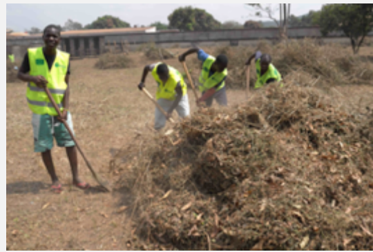
Youth employed by ACTED to prepare the first safe haven in the 5 th Arrondissement.