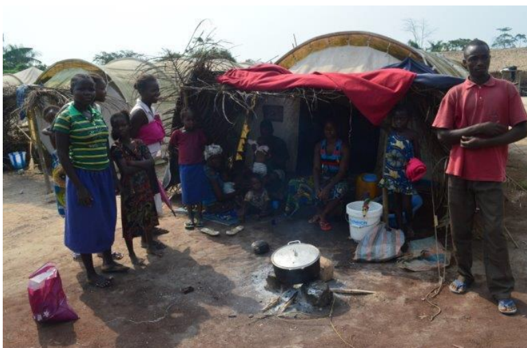
A Central African family outside their shelter in the 15 avril site, Betou, Republic of Congo.