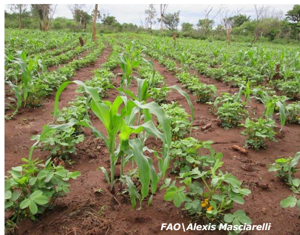
May 2014: Groundnut and maize fields near Bossangoa. Crops have already grown 30 to 40 cm high. Twenty-five kg of seed can lead to potential harvest of 500 kg of food.

In rural areas, WFP and FAO are coordinating distributions to "protect" seeds and other tools to deter that household rely on consumption of seeds or sale of productive assets. In May, 20,000 households (roughly 100,000 persons) benefitted from the seed protection programme; 90 percent of WFP rations were completed the north-west of the country identified as in Integrated Phase Classification 4 (emergency). As of 13 June WFP has reached 5,800 households (approximately 29,000 persons) this month.