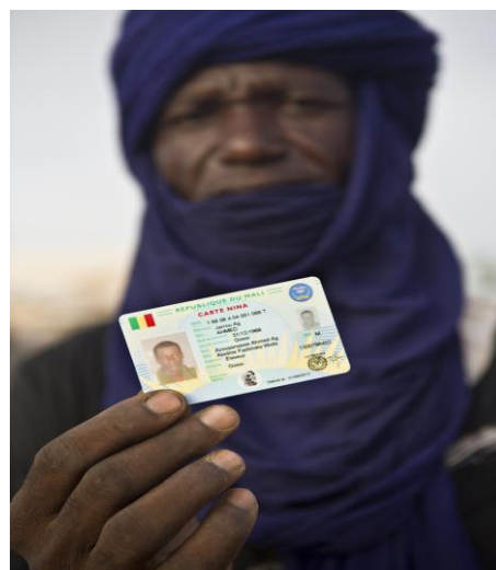
A Malian refugee in Goudoubou camp in Burkina Faso, proudly shows his NINA card, a biometric ID document which is necessary to be allowed to vote for the Malian presidential elections on Sunday 28 July, 2013.