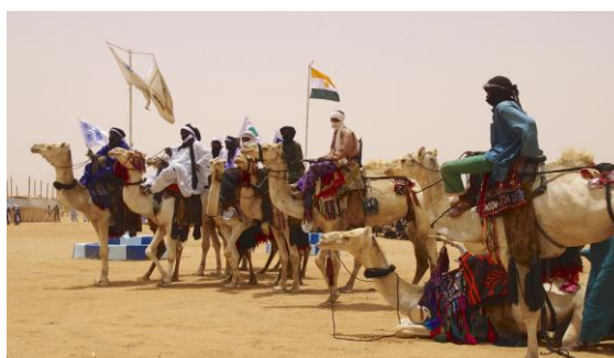
In Intikane hosting area in Niger, refugees on camels welcomed officials and donors. UNHCR/C. Arnaud/ June 20, 2013.

On June 20 th , refugees, UNHCR, partners and local authorities commemorated the World Refugee Day under the theme “ One family torn apart by war is too many ”. Conferences, recreational activities, equestrian show traditional dance and art exhibition have been organized to celebrate the day in Burkina Faso, Mali, Mauritania and Niger.