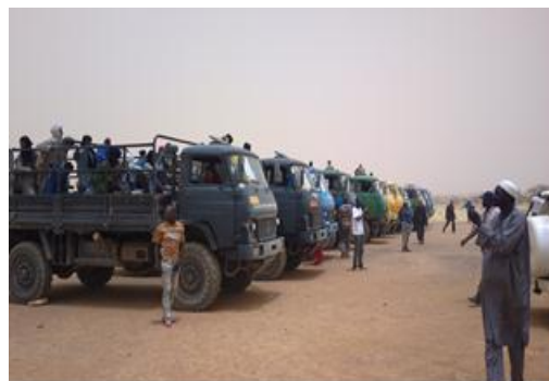
UNHCR organized with IOM, IRC and the Niger Red Cross the relocation of refugees from Mentas and Midal to the new hosting area ("Zone d'accueil") of Tazalit in Niger. UNHCR / Y. Etfagha/ June 30, 2013.

Post-emergency standards for water, sanitation and hygiene have been reached in refugee camps in Burkina Faso. UNHCR and partners continued to work to improve water and sanitation in the refugee camps in Niger, the availability of water stands at 13 liters per person per day.