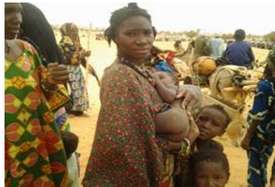
Mother and kids arrive Agando among the displaced, June 2014