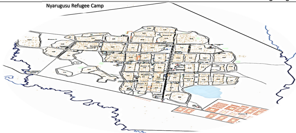
Nyarugusu Refugee Camp