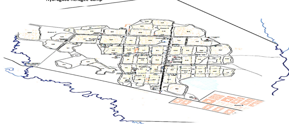
Nyarugusu Refugee Camp