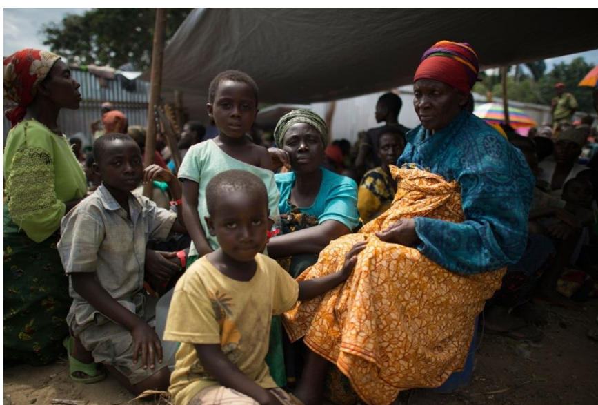
A Burundian family waiting for a ferry to transport them from Kagunga to Kigoma in Tanzania.