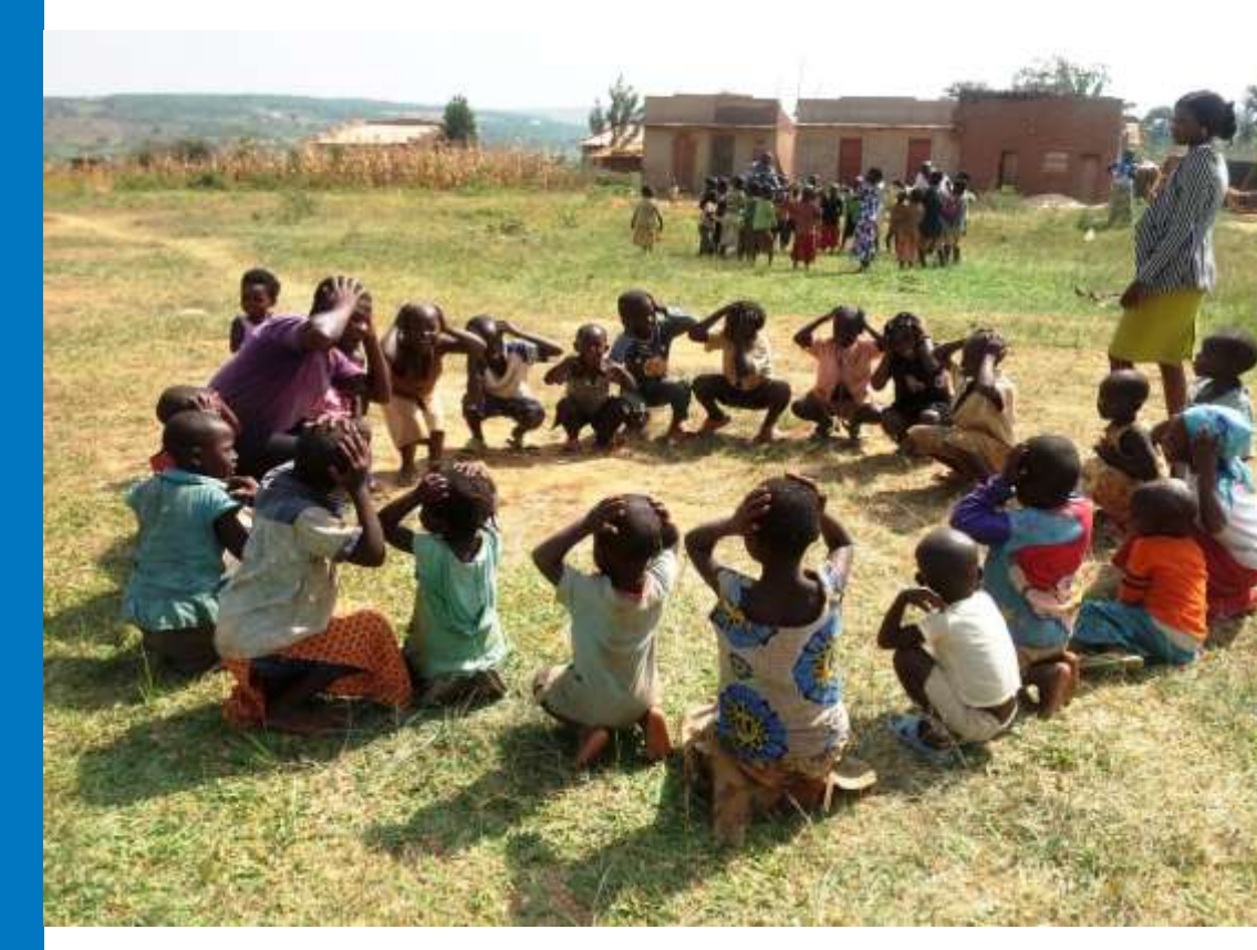
Children of Burundian arrivals participating in physical education at one of the ECD centres in Nakivale Refugee Settlement.