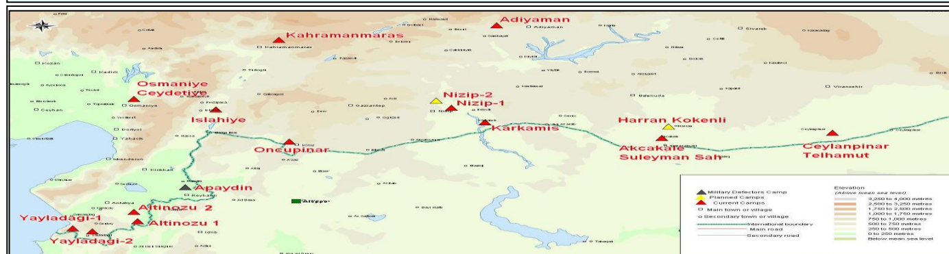
Population by Location 08 Dec. 2012