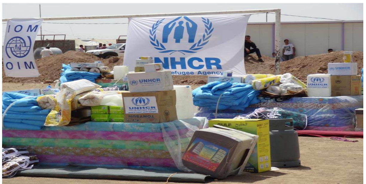
Joint UNHCR-IOM NFI distribution