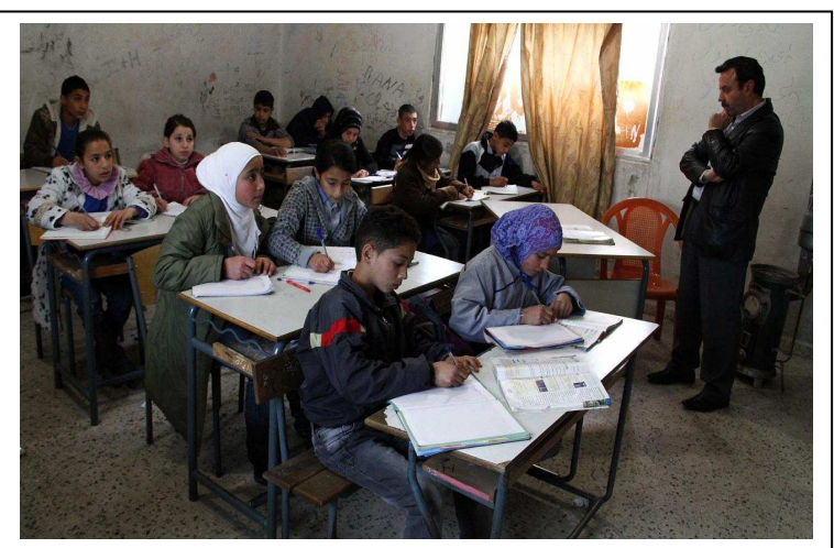
Syrian refugees and Lebanese students in a classroom, Mashta Hammoud, North Lebanon

Shelter: Rehabilitation for the Mineh collective shelter in North Lebanon continued. In the Bekaa Valley, 52 homes were rehabilitated in Aarsal; 23 in Saadnayel and 10 in Fakha. The rehabilitation of a new community center was completed and is now ready to offer recreational activities, remedial classes, counseling and other outreach activities to both Syrian refugees and local Lebanese. Education: Education assessments started in order to identify the difficulties and challenges regarding the education needs of Syrian refugee children. Training of partner staff and volunteers as animators also began