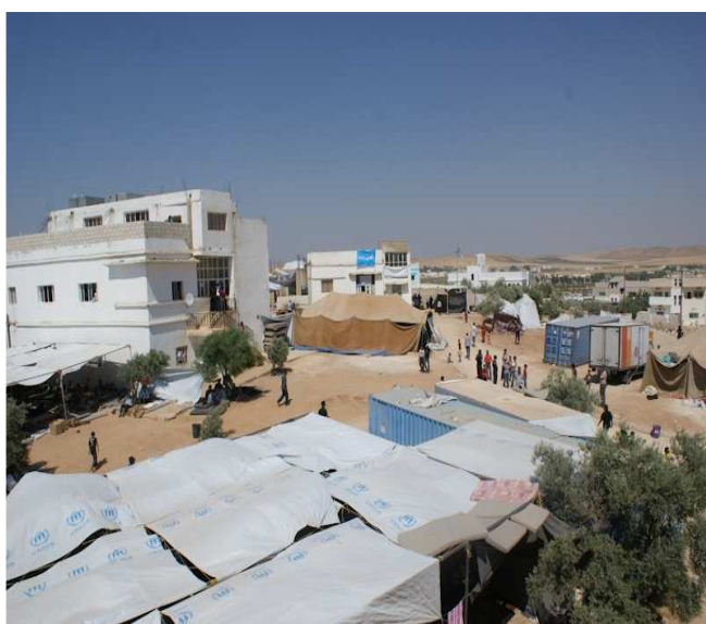
Bashabshe transit site in Ramtha, Jordan. Transit sites in Jordan are managing to cope with increased numbers of arrivals through a referral system to separate reception sites for families and singles in Ramtha and hosting opportunities with families and friends.

This weekly update provides a snapshot of the United Nations and partners' response to the influx of Syrian refugees into Jordan, Lebanon, Iraq and Turkey. The response is led by the UN Refugee Agency and is undertaken in full coordination with host Governments. This report covers the period from 5 to 12 July 2012. The next update will be issued on 19 July 2012.