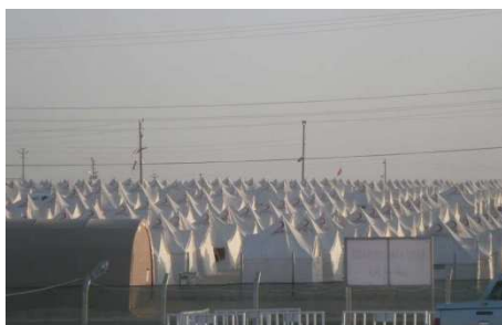
Ceylanpinar refugee site in Sanliurfa, with tents provided by the Turkish Red Crescent