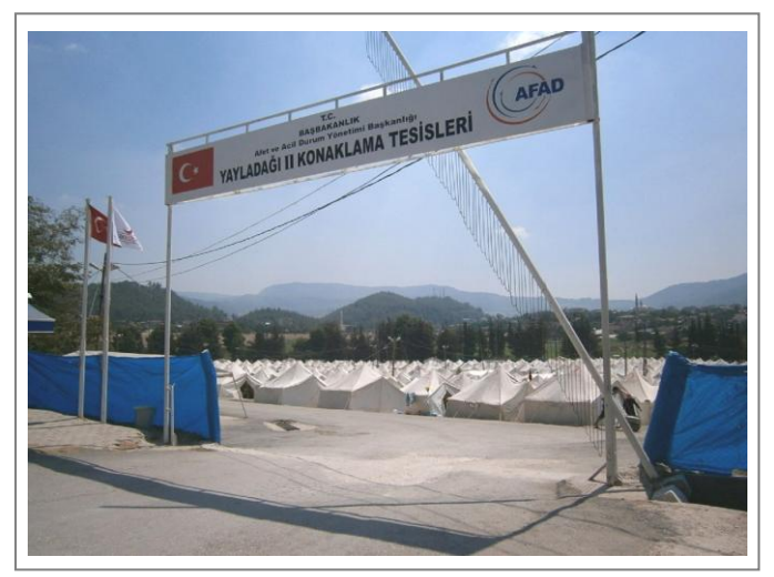
Yayladag camp in Turkey

Kahramanmaras (7,791). In addition, many are temporarily accommodated in boarding schools in Kahramanmaras (5,816), Adana (2,178), Osmaniye (1,458), Malatya (2,885) and Adiyaman (971) until they are transferred to the new camps during the month of September. As of September 05, 13,308 persons (17%) of the official figure are still accommodated temporarily in the dormitories.