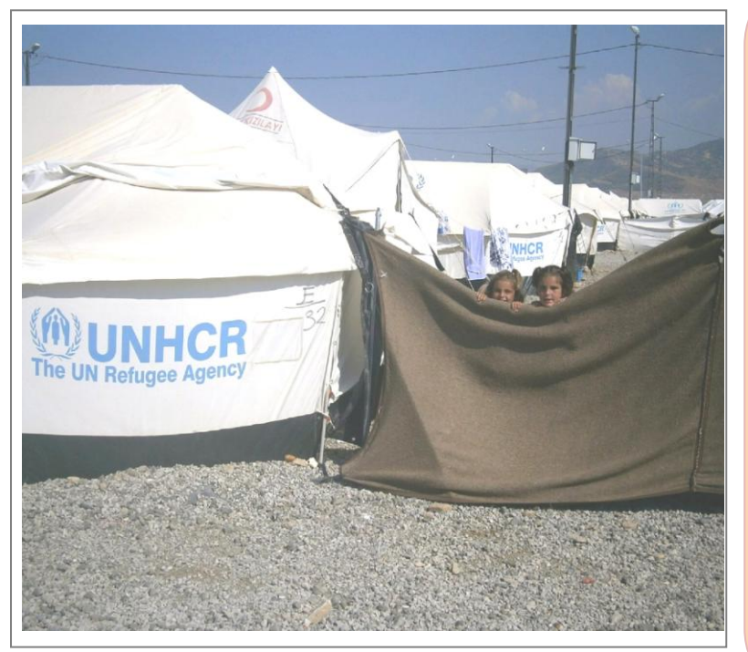
Syrian refugees at Islahiye camp in Turkey

This weekly update provides a snapshot of the United Nations and partners' response to the influx of Syrian refugees into Jordan, Lebanon, Iraq and Turkey. The response is led by the UN Refugee Agency and is undertaken in full coordination with host Governments, UN agencies, and NGO partners. This report covers the period from 1 to 7 September 2012. The next update will be issued on 14 September 2012.