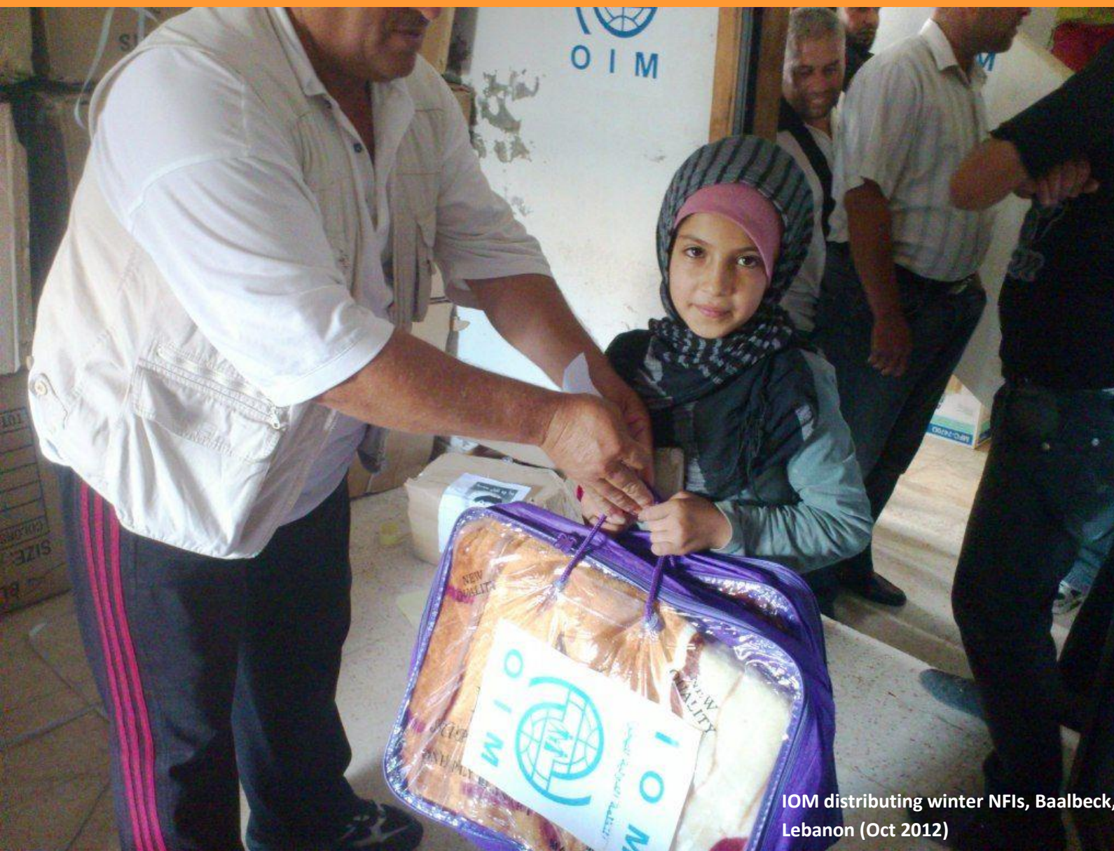
IOM distributing winter NFIs, Baalbeck, Lebanon (Oct 2012)

This report is produced by the International Organization for Migration (IOM) on its humanitarian response for the crisis in Syria. The summary covers events and activities until 18 October. For activities implemented in Syria, please consult the full situation report.