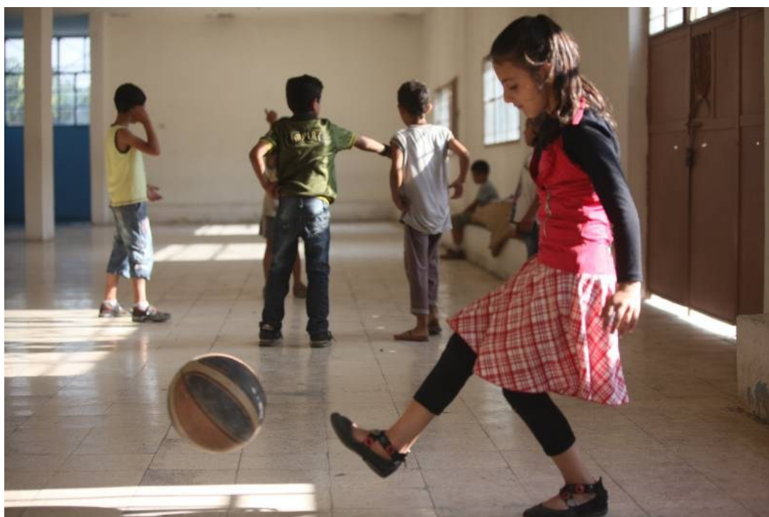
UNHCR and partners have organized activities for Syrian refugee children in the Bekaa Valley, Lebanon.

This system will enable school counsellors to effectively refer children in need of protection services and specialized psychosocial support. In this