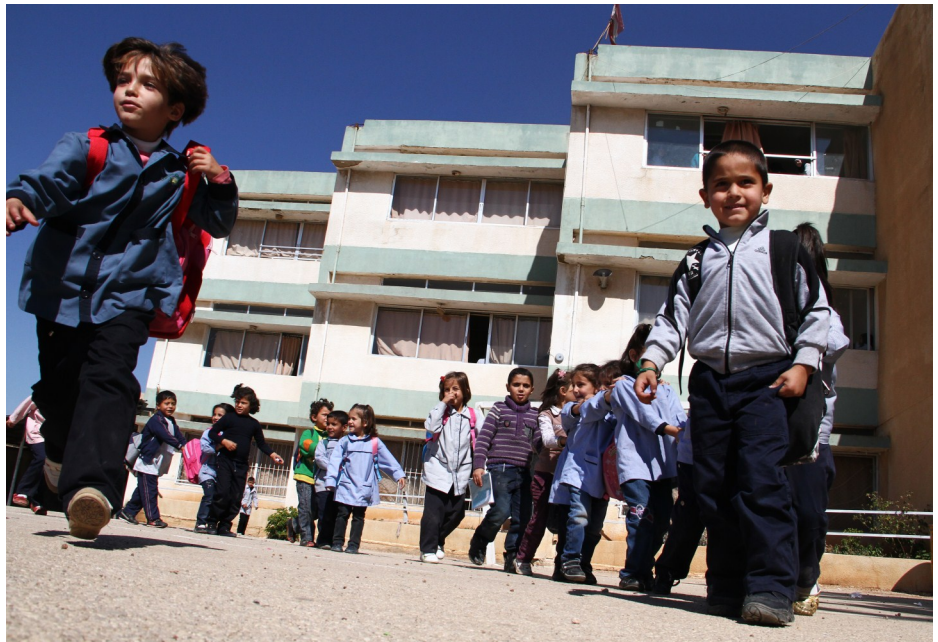
Syrian refugee students in a Baalbeck school, Bekaa Valley, Lebanon.