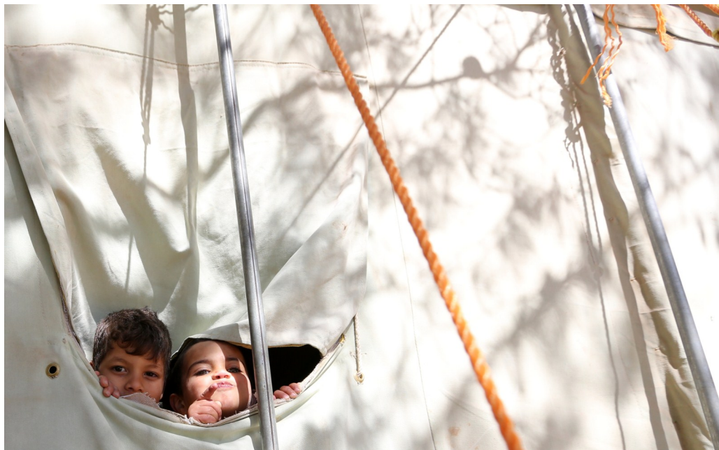
Palestine refugee children in Cyber City, Jordan.