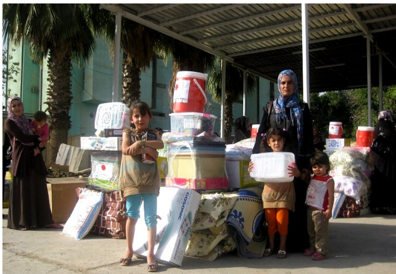
A woman and her children receive an NFI kit in Erbil. Many families cross the border with only a few suitcases of clothes and some valuables, few carry basic household items.

From 27 June to 2 July, IOM distributed supplementary items to around 400 Syrian refugee households who were not part of previous NFI distributions in Domiz camp. Domiz camp is now home to some 40,000 Syrian refugees. The camp remains overcrowded with nearly half of the refugee families sharing tents due to lack of land. The distributed kits contained hygiene items, plastic food containers, coolers and rechargeable fans to assist refugees to cope with high summer temperatures. The distribution of these essential NFIs will continue until the end of July, and aims to provide NFIs to around 4,000 vulnerable Syrian refugee households.