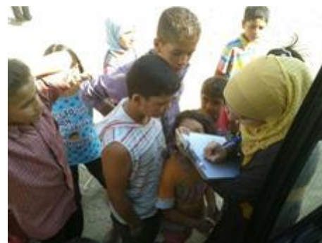
Community outreach in Al Marj tented settlement

UNICEF has commenced equipping Primary Healthcare Centres to monitor and treat malnutrition, with micronutrients, therapeutic foods and portable equipment for measuring malnutrition distributed to implementing partner International Orthodox Christian Charities.