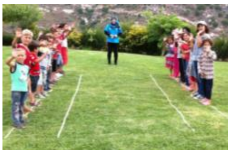
Children play at Intersos' Child Friendly Space in Nabatiyeh

Child Protection In the past fortnight, UNICEF partner Intersos had 335 children attend activities in Child Friendly Spaces in Arab Salim and Bent Jbeil, as well as 344 children attend Child Smart Bus mobile activities in Nabatiyeh and Tyre. Activities included making cards for Eid, awareness sessions about the five senses, cooking classes for traditional dishes and awareness sessions on non-violent communication. This brings the cumulative total for children provided access to psychosocial support services to 51,325 this year.