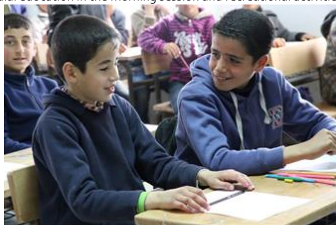
Boys at school in Za'atari camp.