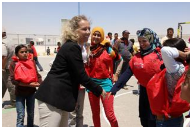
JCO Representative joins a basketball game in Za'atari

Child Protection: UNICEF supports 65 Child and Adolescent Friendly Spaces (42 in camps and 23 in host communities) which provide psychosocial support to children. A further 10 playgrounds and multipurpose courts providing recreational activities are supported in Za'atari, KAP, Emirates Jordanian Camp (EJC) and CC. During the reporting period, seven more spaces have been added in three governorates in host communities with the approval of an agreement between UNICEF and INTERSOS/JOHUD by Jordanian Government.