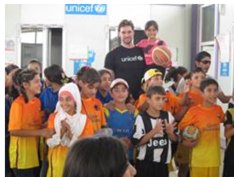
UNICEF Goodwill Ambassador Pau Gasol plays basketball with children in Domiz Camp in Iraq.

IRC in partnership with UNICEF has completed six days of case management training attended by 16 child protection workers from ACTED and UNICEF/DoLSA CPU.