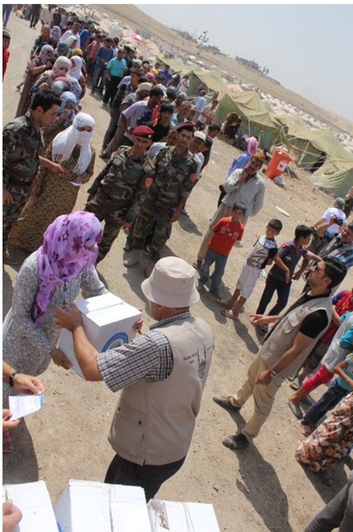
Food distributions at the Kawergosk temporary site in Erbil Governorate, Kurdistan Region in northern Iraq. Approximately 15,000 Syrian refugees are accommodated at the site. UNHCR

• Mass information - UNHCR has launched a mass information campaign to inform Syrian refugees regarding registration procedures. A mobile team of 52 Syrian refugee volunteers have begun conducting tent visits in Kawergosk to provide initial information on registration procedures and gather information from refugees on any issues they are facing for follow-up.