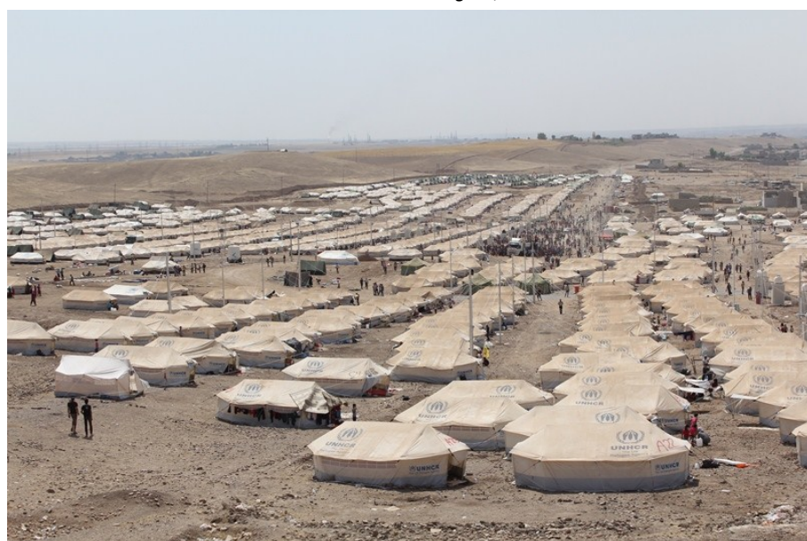
Below: A transit site has been established at Kawergosk, Erbil Governorate.