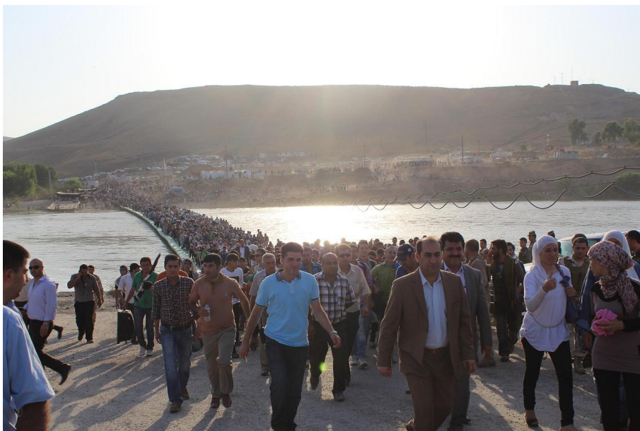
Above: Thousands of Syrians streamed across a bridge over the Tigris River last Thursday into Iraq's Kurdistan Region.