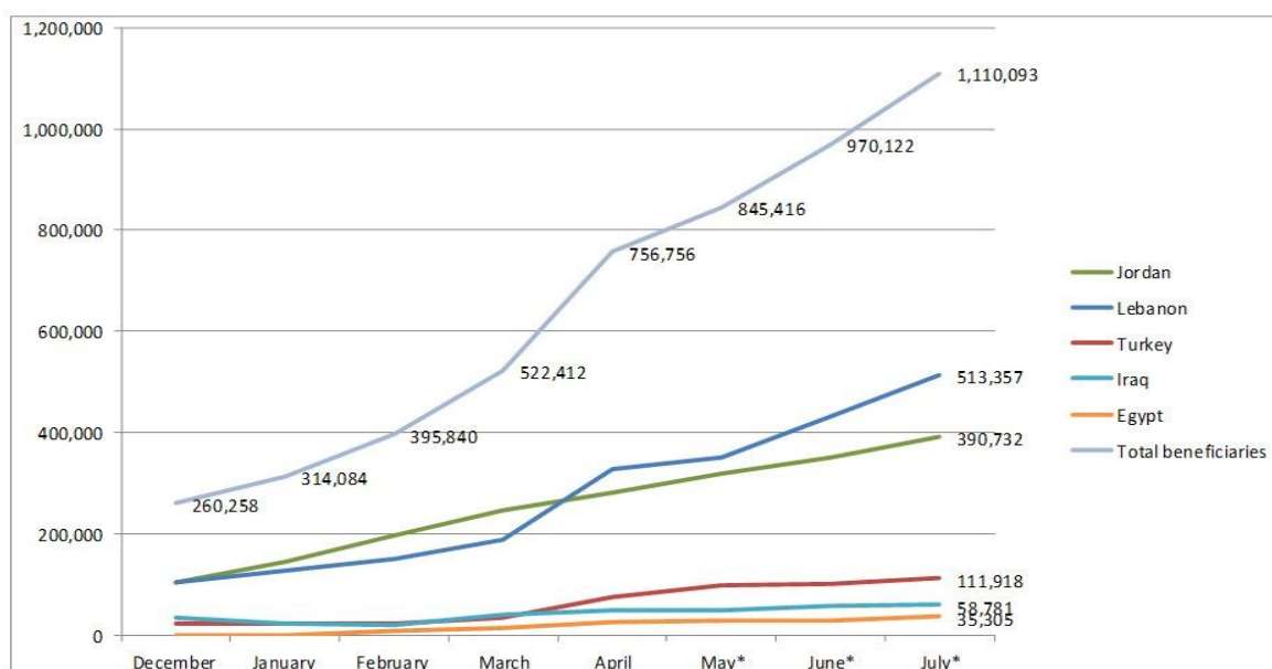
WFP Food Assistance Beneficiaries - December 2012 - July 2013

As of 14 August 2013 *reconciliation of figures ongoing.