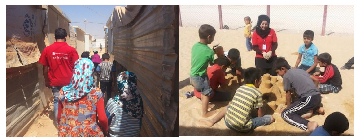
SCI Field Worker, conducting social mobilization in Za'atari

During the reporting period, UNICEF/IRC identified and registered 14 unaccompanied and 28 separated children in Za'atari. These cases are being closely followed up.