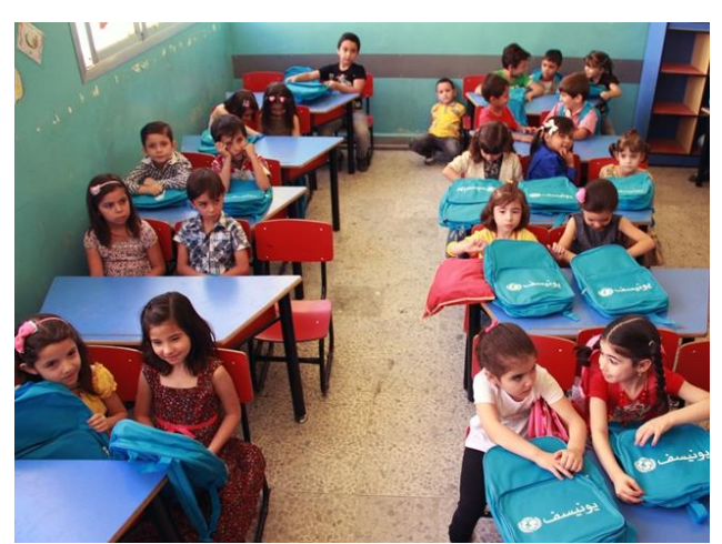
A class of first graders at a school in Damascus are ready for their first school year after receiving UNICEF school bags and stationery.

In addition, 5,000 blankets and 5,000 plastic sheets were dispatched for distribution to internally displaced people through the UNICEF convoy to ArRagga.