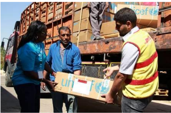
UNICEF, in cooperation with the Ministry of Education and other partners around Syria, is supporting a Back to Learning campaign that will distribute school bags with stationery supplies to one million children in all of Syria's 14 governorates.

In order to reach children in difficult to access locations, UNICEF has finalized an innovative home-based self-learning programme in partnership with the Ministry of Education and UNRWA. Around 400,000 conflict-affected children who are unable to go to school due to the on-going conflict will benefit from this programme. The first phase, designed for lower