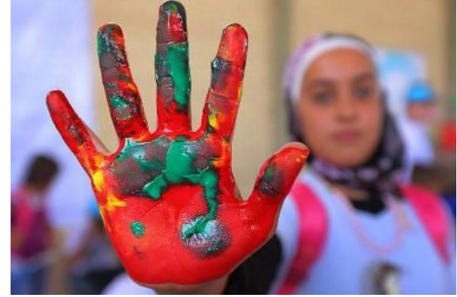
Syrian refugee girl showing off her painted hand she printed on a Back to School banner.

A Child Friendly Space (CFS) in Baherka started on 9 September in partnership with Save the Children. Some 80 children are attending the activities per day. UNICEF is providing CFS training for Public Aid Organization in order for them to start a CFS in Kawergosk camp.