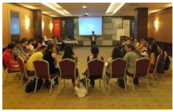
Youth worker training.

The second round of training for youth workers employed through the Turkish Red Crescent Society ran from 8 to 13 September in Gaziantep. Twenty-four youth workers and two administrative staff from the Turkish