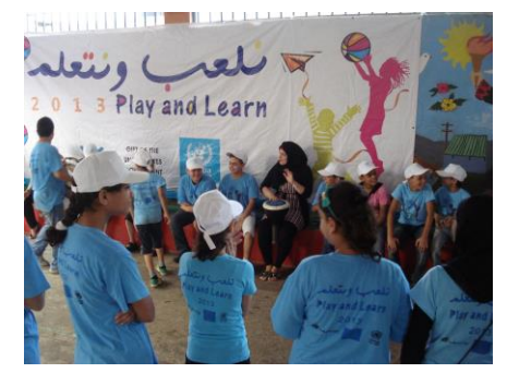
Play and Learn for PRS.

There are currently 93,000 Palestinian refugees from Syria (PRS) registered with UNRWA in Lebanon. The majority of households are living inside camps across all areas, with the influx concentrated within large camps (Ein El-Helweh, Rashidiyeh, Beddawi and Nahr el-Bared camp).