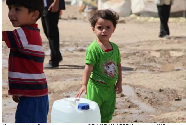
Kawergosk refugee camp, west of Erbil

In Qasrok camp (under construction), UNICEF and KURDs are installing water tanks, latrines, showers and water benches. UNICEF is also assessing Bersive and Batifa (Zakho) and planning the WASH response for Kandala Reception Centre and Gawilan Camp (both still under construction).