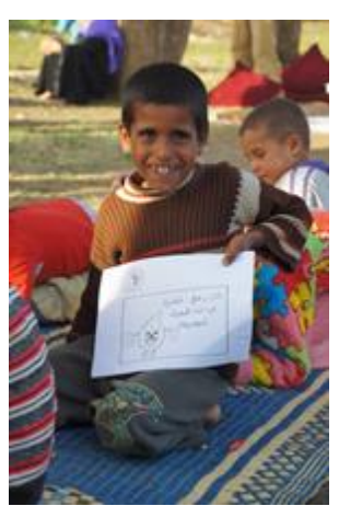
Hygiene promotion activities in tented settlements.

Water and sanitation interventions are being prioritized in Miniara and Minieh 1 tented settlements by UNICEF implementing partners, PU-AMI and Solidarites International, after a UNHCR health partner identified 58 severe cases of diarrhea in the settlement. UNICEF Health and WASH specialists also