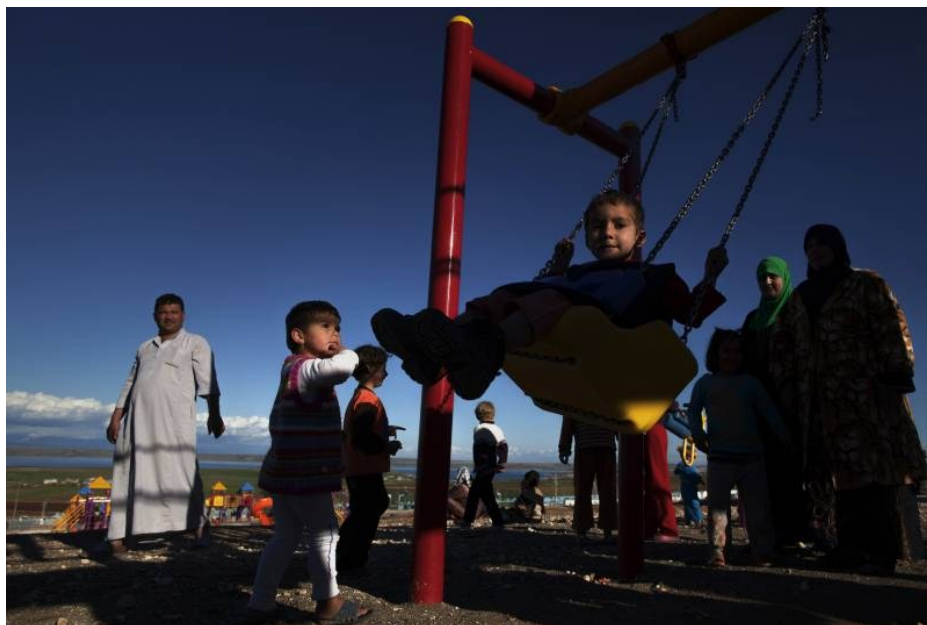
A Syrian child plays on a swing in a playground area established in Adiyaman refugee camp, Turkey. The services provided at the camp address both the physical and psychosocial needs of the refugees.

The regional response for refugees fleeing Syria is the coordinated effort of 126 participating organizations, including 84 appealing: