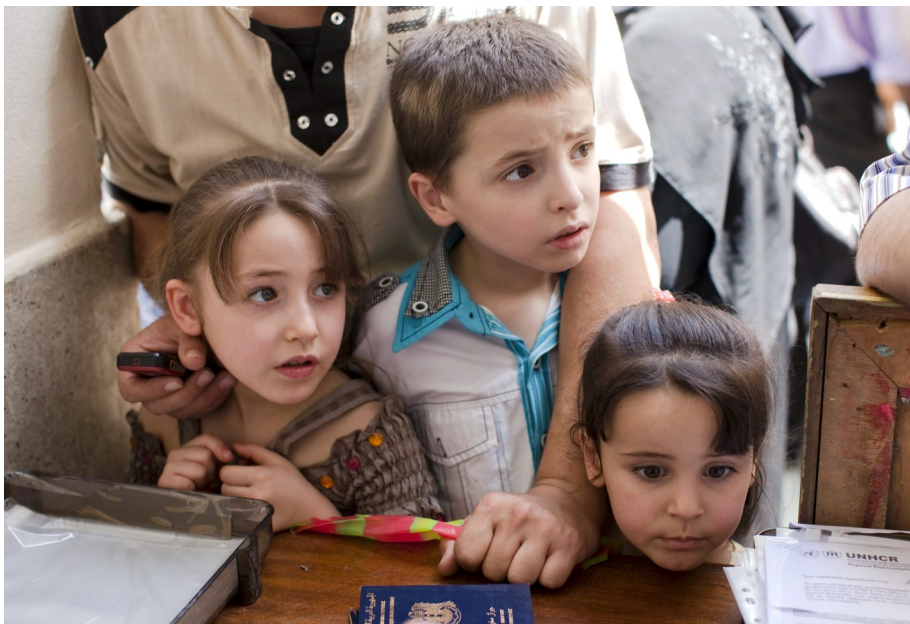
Three Syrian siblings from Damascus registering with UNHCR in Zamalek, Cairo.