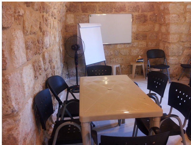
The vocational training and education centre in Beddawi, North Lebanon.

the municipality of Kfar-Habou in Dannieh: the school bus will be used by the public school to transport Syrian and Lebanese students to and from school throughout the academic year.