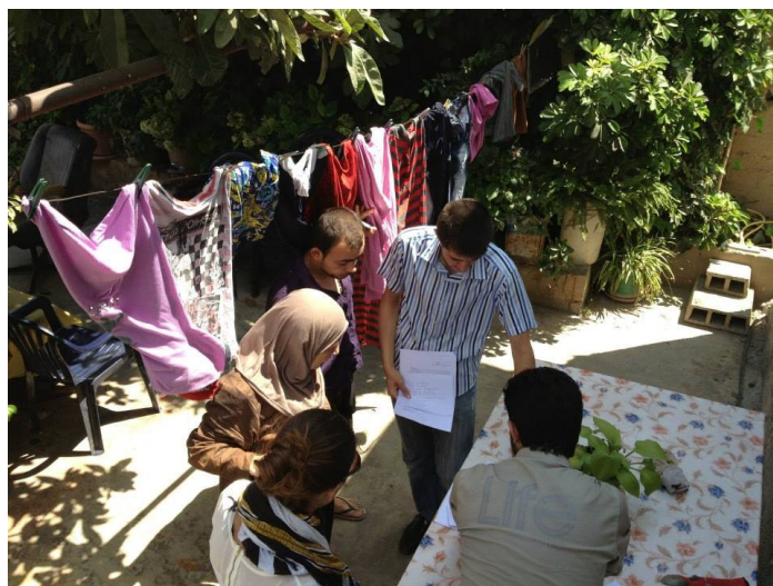
A Lebanese family that is hosting an elderly Syrian woman.