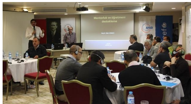
ToT for teacher trainers in Turkey.

Between the 4 and 6 October, the first Training of Trainers (ToT) was undertaken in Adana for 27 participants made up of Ministry of National Education (MoNE) trainers, Syrian teacher trainers, and MoNE camp focal points from Hatay, Adana, Osmaniye, Kahramanmaraş, Malatya and Kilis as a first step for the roll out of training to Syrian teachers in the camps. The aim of the ToT was to train the trainers in the content for the teacher trainings including education in emergencies, child development, the impacts of war on children, basic teaching skills, classroom management, child-centred teaching, and how to set up a camp-based mentoring and support system for teachers. The second ToT will be completed in Sanliurfa between the 25 and 27 October. Following the completion of the ToTs, teacher trainings will be rolled out to approximately 1,410 Syrian teachers who are teaching over 45,000 Syrian students so far in the camps.