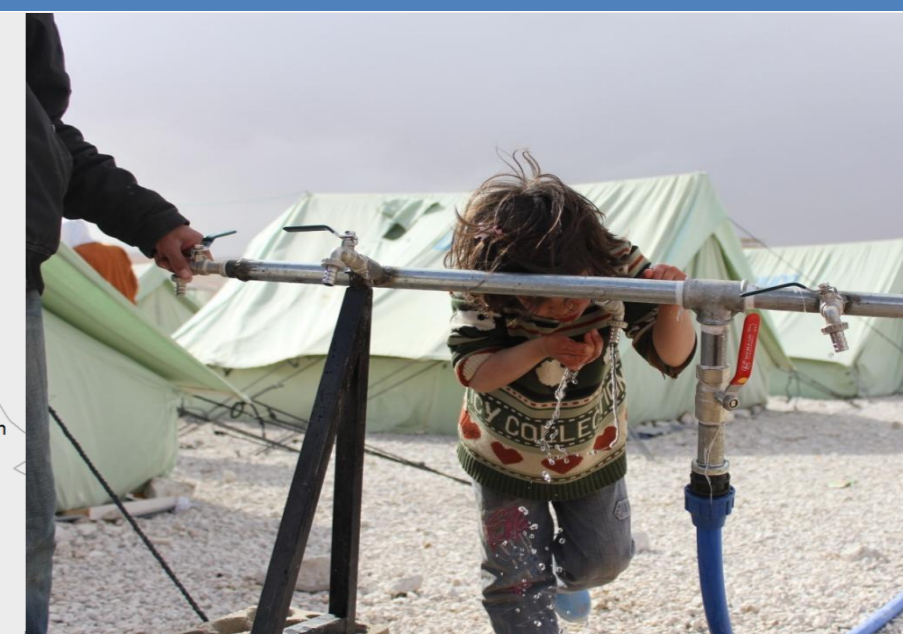
Child accessing a water point in the temporary shelter site in Arsal 2013-11-27