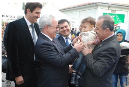
Polio campaign launch event.

On 18 November, a polio vaccination campaign was launched by the Ministry of Health with support from UNICEF and WHO in Gaziantep. The first round of polio vaccinations aimed to reach 1,061,000 children under 5 in the seven provinces on the border with Syria (Kilis, Hatay, Mardin, Sanliurfa, Gaziantep and Sirnak) and Adana. Public health officials stated that over 4,000 health personnel were deployed for the campaign, with subsequent rounds occurring over December and January. According to the MoH roughly 1,300,000 children were vaccinated. There no cases of polio have been detected in Turkey; these campaigns are precautionary in order to prevent any possible outbreak. UNICEF is providing 3,350,000 doses of polio vaccine to the Ministry of Health for the subsequent vaccination rounds, as well as outreach and communication materials in Turkish and Arabic for the campaign. UNICEF