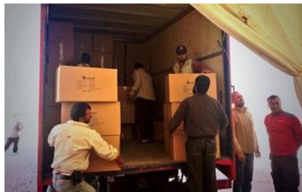
Winter clothes for young children arriving at NRC warehouse

WASH In consultation with implementing partners, UNICEF is in the process of finalizing the installations of structures in Azraq Camp. The partners have developed a contingency plan making it possible to have the WASH facilities fully operational within two weeks' notice (based on UNHCR interagency position paper on Azraq camp). With the already installed facilities, the camp can accommodate 30,000 refugees. Remaining funds will for the time being be reallocated for interventions in Za'atari camp and host community as prioritized by sector partners.