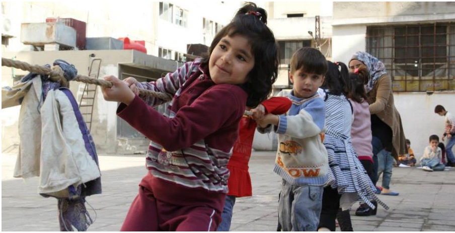
Children in Homs City