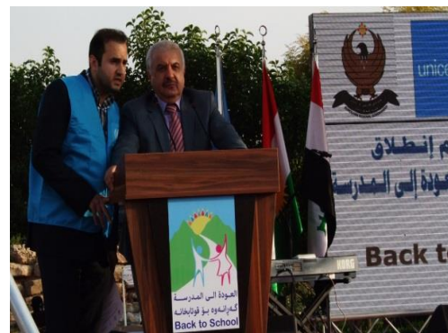
Back-to-School launch by HE Minister of Education UNICEF Iraq/2013

UNICEF also provided schools in four camps in Erbil with bags and stationary sufficient for 4,550 students. Due to the relocation of more families into Darashakran camp, enrollment at the camp school has increased by 20 per cent (from 960 to 1,150 students).