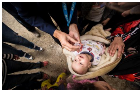
A child receives oral vaccine at UNHCR registration centre.