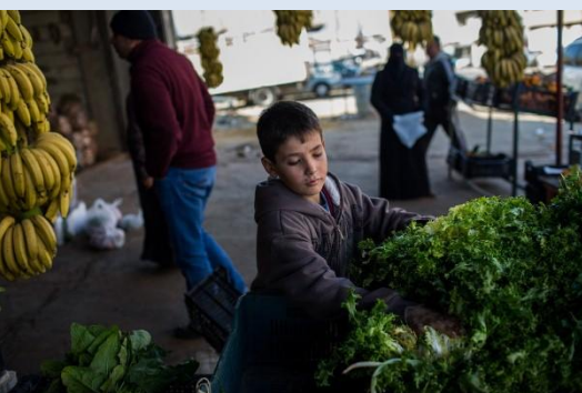
Syrian Refugees boy, sorts vegetables at a groceries store in Bebnine, Akkar