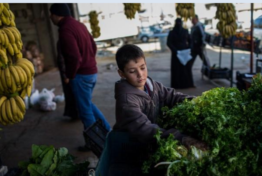
Syrian Refugees boy, sorts vegetables at a groceries store in Bebnine, Akkar