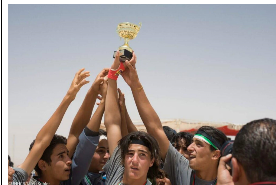
The winning team raise the trophy after competing in the World Refugee Day Football tournament in Zaatari camp on 20 June.