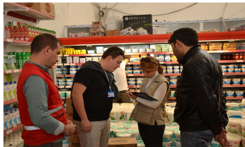
WFP field monitors in Harran camp conducting the monthly Price Market Monitoring. Sanliurfa

In 17 of the 21 camps where programme is operational, WFP and TRC, in close cooperation with AFAD, have established committees for the monitoring of market prices. Positive developments have been noted in largely stable prices and special programming for the month of Ramadan which includes extended shopping hours and higher stocks of traditional foods.