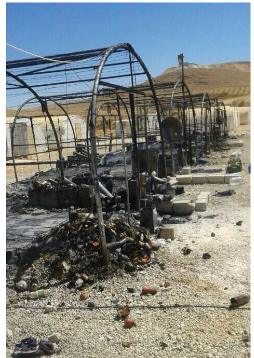
Shelters in the Aarsal transit site burned down when the site was hit by shelling.