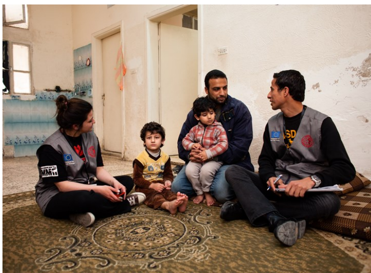
PU-AMI Field Officers visit Syrian families everyday.

Partnerships are implemented with CBOs aiming at empowering the organizations and reinforcing the efficiency of the action for the most vulnerable populations. PU-AMI Field Officers continuously implement, through Rapid Household Assessments (RHA) during home visits, a field screening of vulnerable families in order to trace immediately new arrivals that might be in need of help in the areas of intervention.